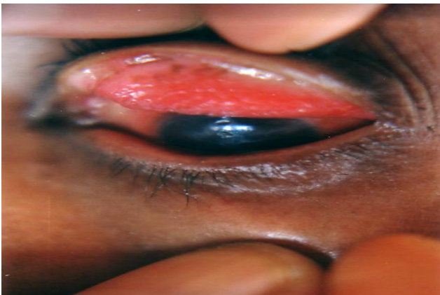
Fig 4 This case has large follicles with keratinisation of marginal palpebral conjunctiva (photographed after permission from the patient, by Dr. Mohnish Gopal)

Trachoma has been notorious for parched / xerotic conjunctiva, Bitot spots and superficial corneal epitheliopathy amidst lot of reflex watering due to scarring of fornices and palpebral conjunctiva . This is like the proverbial thirsty fish amidst plenty of water. (photographed after permission from the patient, by Dr. Mohnish Gopal)